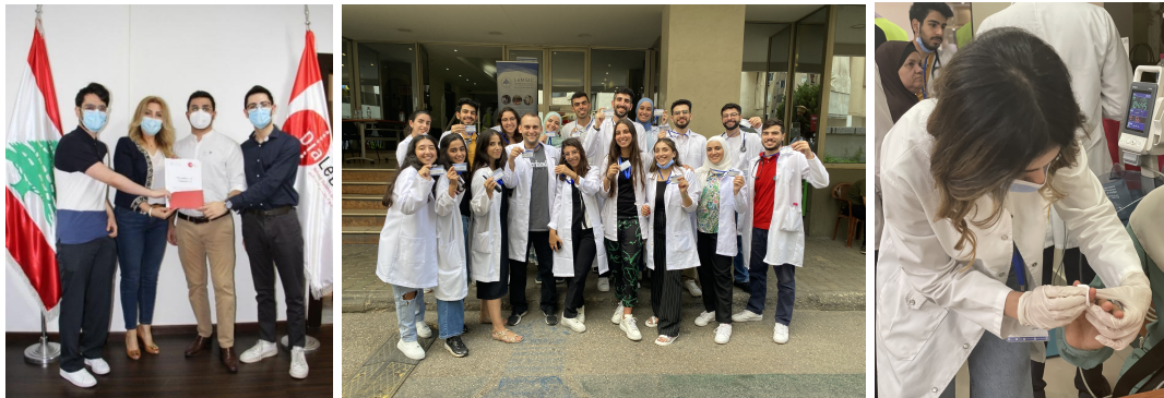
- Joint booth at Beirut Marathon 2023 Race